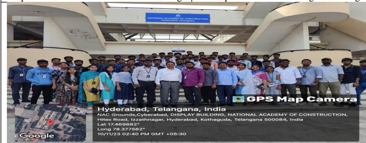
III & IV Year Students and Faculty group photograph in NAC