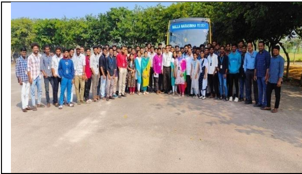
Students and faculty at NNRG before the start to the Visit